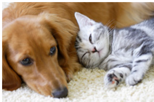
On the hottest days, you can rely on Trane TruComfort to keep your entire family cool.