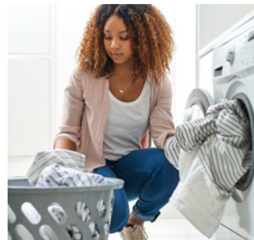
Keep your clothes dryer in good working order to help prevent a fire.